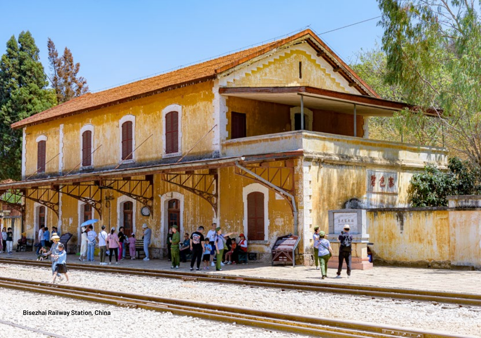
Bisezhai Railway Station, China