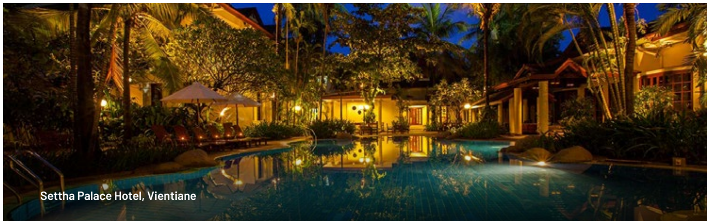
Settha Palace Hotel, Vientiane

We have carefully selected our hotels and resorts based on a range of factors including location, customer feedback, value for money, and atmosphere. Please note that hotels of a similar standard may be substituted if necessary. Some of our chosen accommodation for this tour includes: