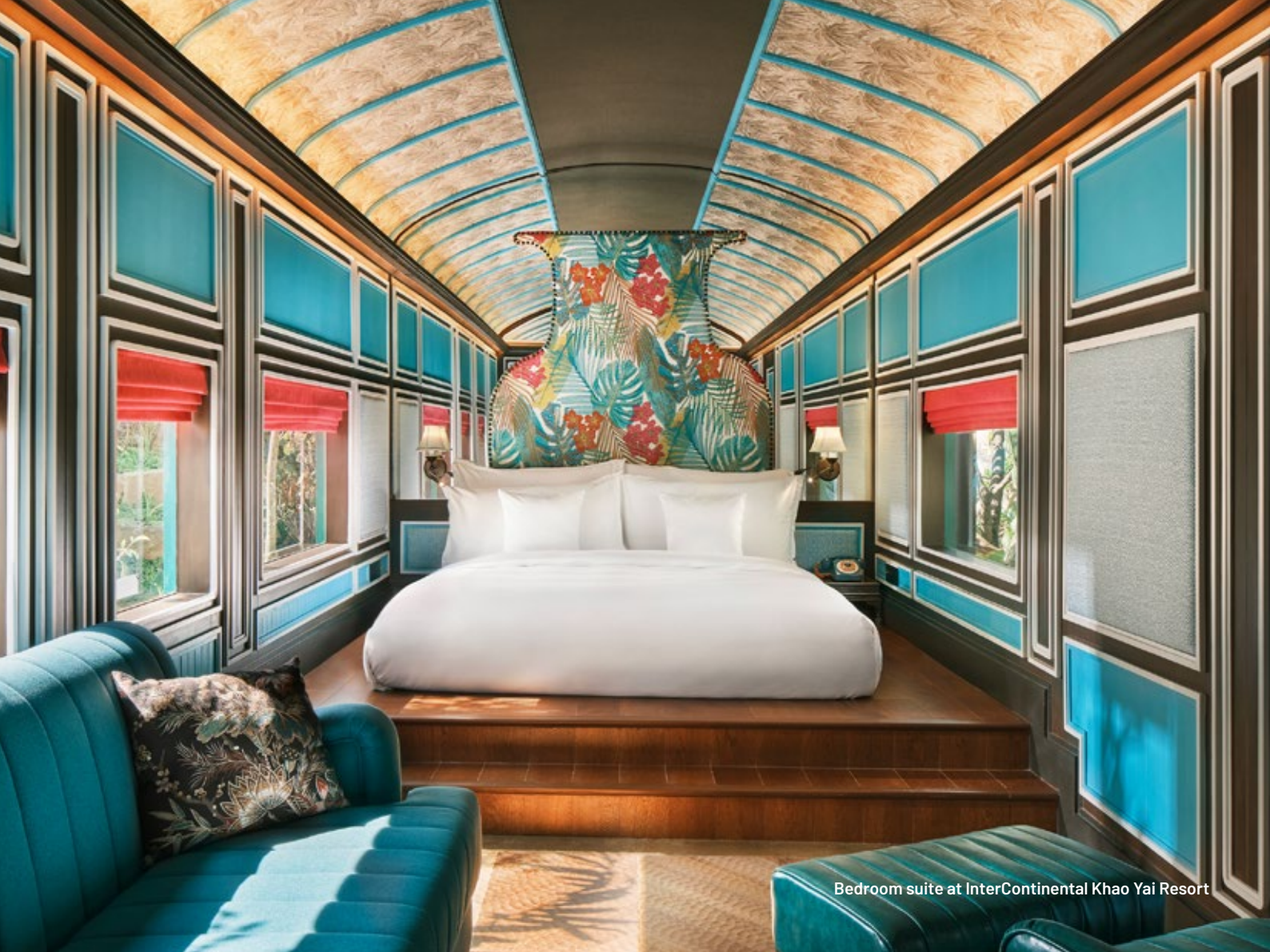
Bedroom suite at InterContinental Khao Yai Resort