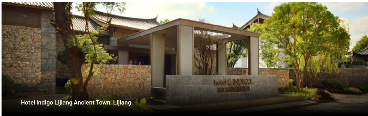
Hotel Indigo Lijiang Ancient Town, Lijiang