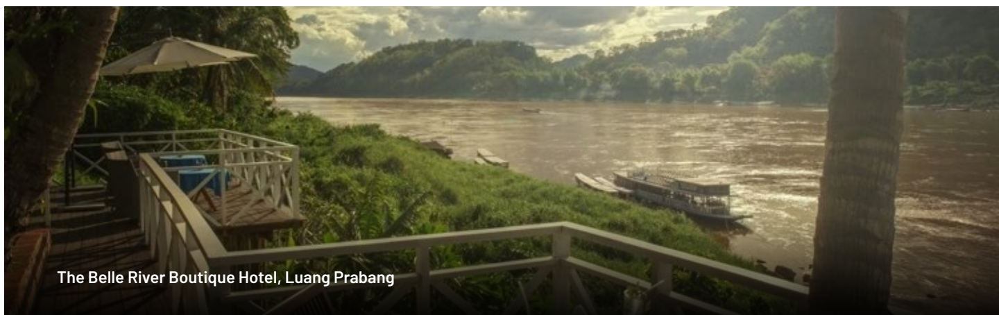
The Belle River Boutique Hotel, Luang Prabang