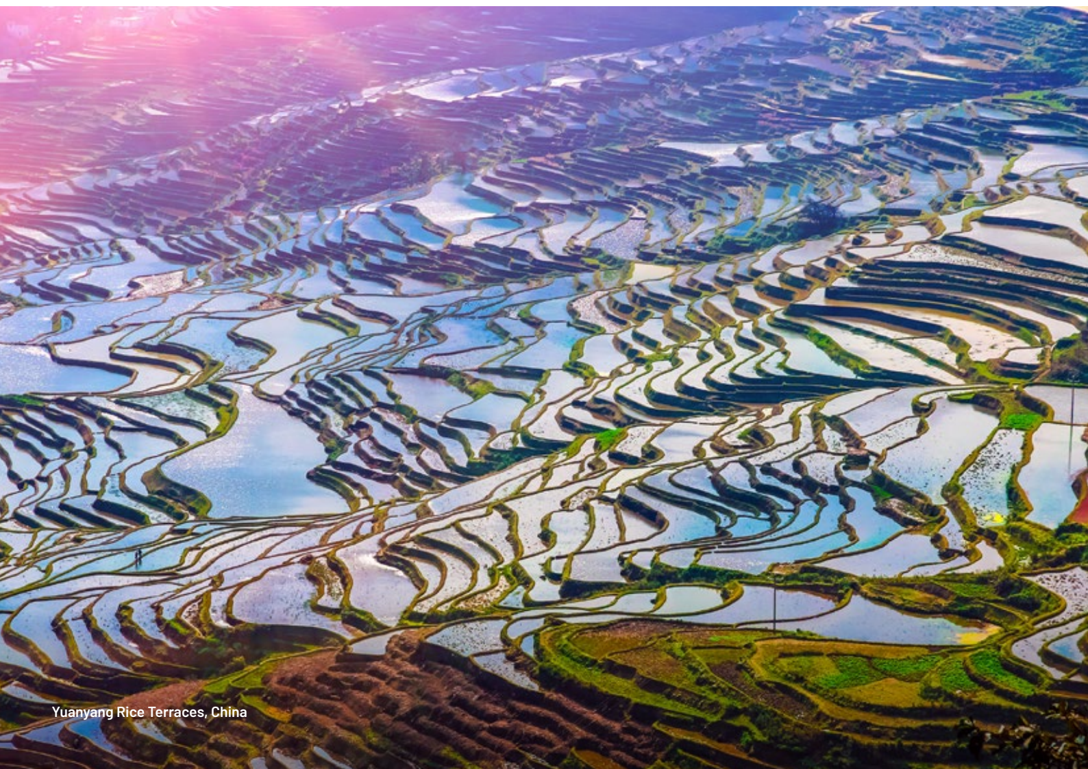
Yuanyang Rice Terraces, China