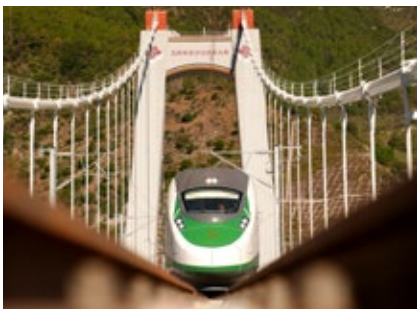
High Speed Rail from Kunming to Lijiang

Not only will you experience the best train trips that your destination has to offer, but you'll also explore the surrounding areas in comfort and style with our private luxury coaches. Our knowledgeable guides will lead you on walking tours, and you will take other suitable and exciting travel options to make your exploration easy and enjoyable.