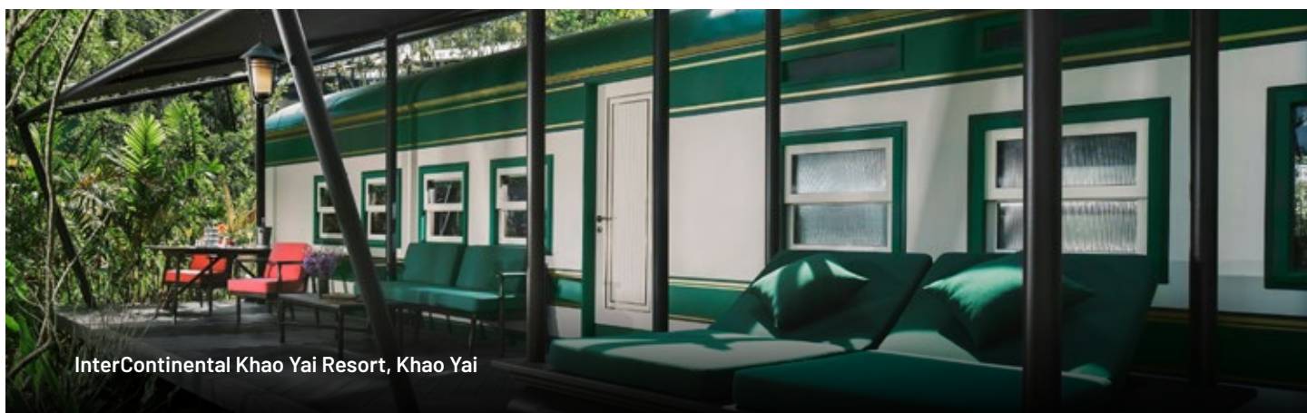
InterContinental Khao Yai Resort, Khao Yai