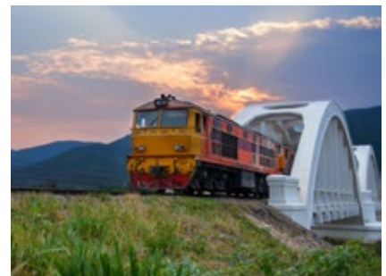
Vientiane to Bangkok Express