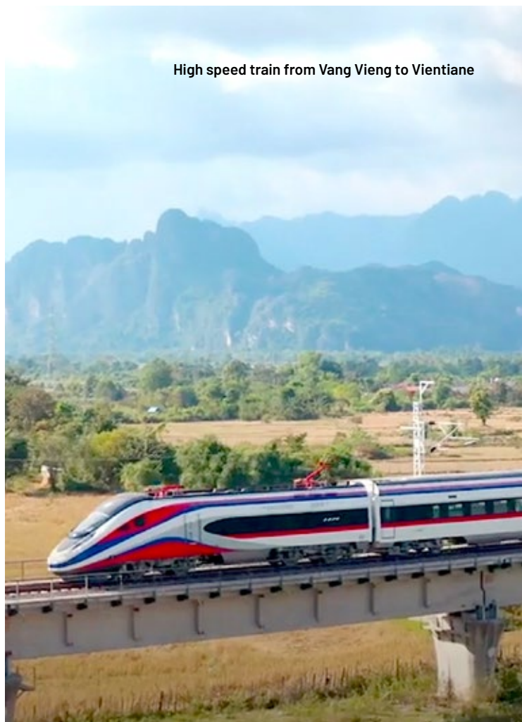
High speed train from Vang Vieng to Vientiane

In the early afternoon we'll transfer to the Luang Prabang train station for your high-speed first class train journey to Vang Vieng, travelling the 185 km in just under an hour. Upon arrival we'll transfer directly to our hotel and check in.