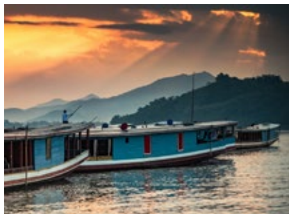
Mekong boat tour